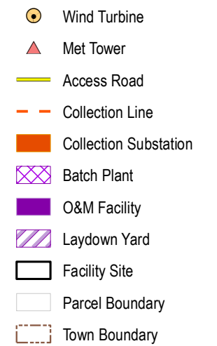
Figure 2-2. Facility Layout

Article 10 Application Case No. 16-F-0205